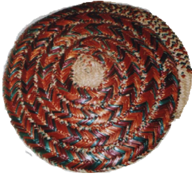
Meshrefet: traditional fan, used to blow fire or cool oneself during a hot day.